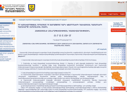
Screen shot of the new STS website secondary page